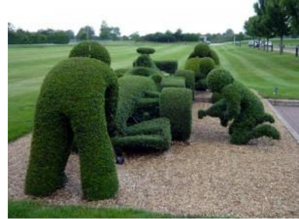
Sir Frank Williams' F1 topiary